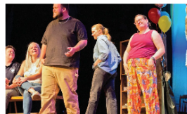
Community play at Stonington Opera House 99 percent sold out