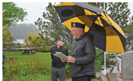
Memorial Day tribute in Deer Isle not somber despite soggy weather

Go To The Island Ad-Vantages Highlights Section