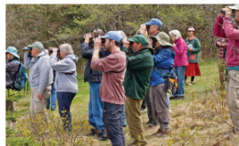
What do birds have to do with your morning brew? The answer may surprise you.