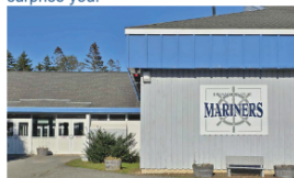
CSD 13 board tables school budget vote amid fervent feedback