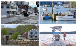
Peninsula towns struggle to turn climate plans into action