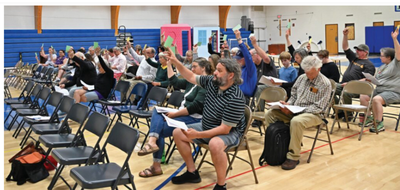
Voters at the May 26 CSD 13 budget validation meeting show near unanimous support for one of 21 warrant articles that made up the proposed 2026-27 school spending plan. All of the articles passed handsily and the proposed budget now goes before voters on June 9. BY JACK BEAUDOIN

THE ISLAND—Attendees at the May 26 CSD 13 District meeting approved all 21 warrant articles on the ballot, sending the 2026-27 school budget to a June 9 referendum, where voters from Deer Isle and Stonington will have the final say on the $8.3 million spending plan.