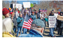
Photo: No Kings brings big crowd to Deer Isle