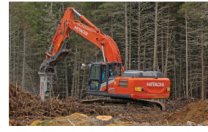
Photo: Isle au Haut digs deep for community center