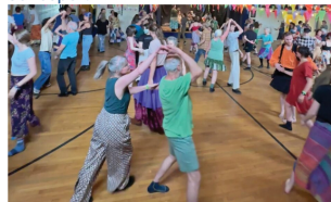
Dancers from across Maine gather for Contra Dance Weekend in Surry

Contact Us Subscribe Advertise with Us Visit Our Book Website