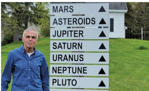
Author in Surry shares insights of small town life