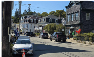
Stonington's historic commercial district to get public information session