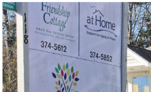
Friendship Cottage secured with closing on purchase in Hancock County