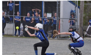
Scott's Sports Spot: Deer Isle-Stonington girls lose close game to Jonesport