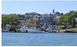
View from Atlantic Avenue (week of May 28, 2026)