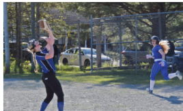
Scott's Sports Spot: Deer Isle-Stonington girls win one, lose one

Go To The Island Ad-Vantages Latest News Section