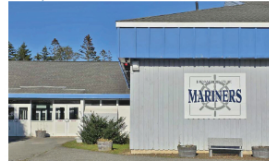
CSD 13 board in Deer Isle-Stonington sends $8.3 million budget to voters