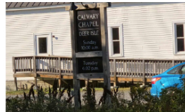
Island church news (week of May 28, 2026)