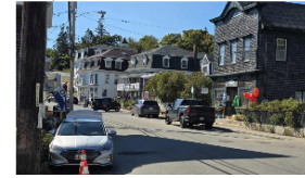
Downtown district in Stonington faces 'historic' opportunity

Contact Us Subscribe Advertise with Us Visit Our Book Website