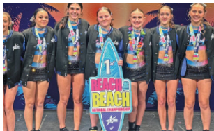
Photo: Deer Isle-Island Cheer brings high energy to Ocean City, Maryland

Go To The Island Ad-Vantages Highlights Section