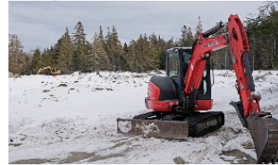
New $3 million community center makes progress on Isle au Haut