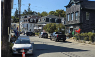
Town of Stonington's proposed spending plan scrutinized at public meeting