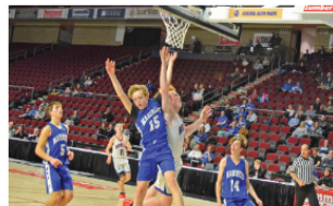
Scott's Sports Spot: Varsity teams growing stronger and learning