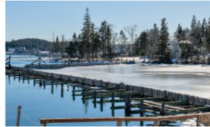
Greenhead aquaculture leases approved by Department of Marine Resources

Contact Us Subscribe Advertise with Us Visit Our Book Website